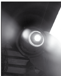
High output setting