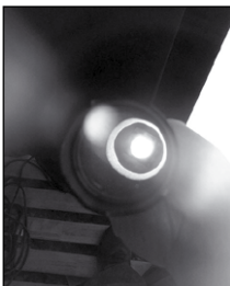
Medium output setting