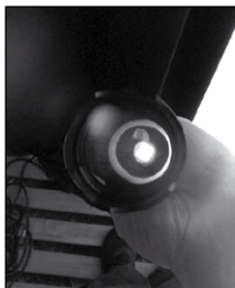
Low output setting

The IR850 Supernova has 4 stage output-Low at 5%-30%-70%-100%. These modes can be accessed by turning the brightness control ring.