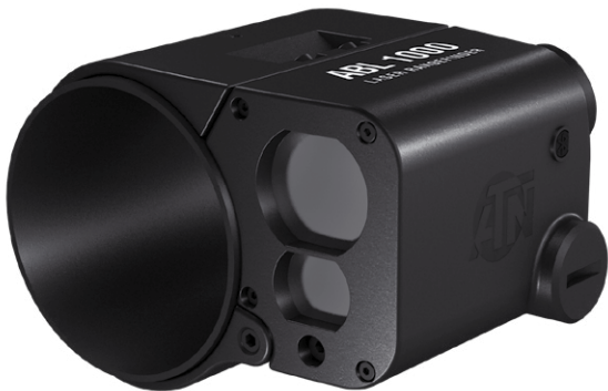
AUXILIARY BALLISTIC LASER (ABL 1000/1500)

Important Export Restrictions! Commodities, products, technologies and services contained in this manual are subject to one or more of the export control laws and regulations of the US BIS-Department of Commerce, Export Administration Regulations. It is unlawful and strictly prohibited to export, or attempt to export or otherwise transfer or sell any hardware or technical data or furnish any service to any foreign person, whether abroad or in the United States, for which a license or written approval of the U.S. Government is required, without first obtaining the required license or written approval from the Department of the U.S. Government having jurisdiction. Diversion contrary to U.S. law is prohibited.